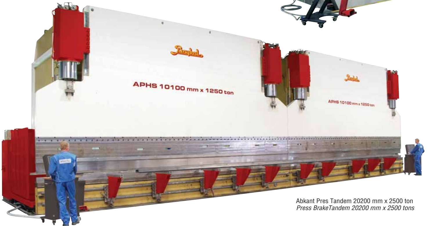
Abkant Pres Tandem 20200 mm x 2500 ton Press Brake Tandem 20200 mm x 2500 tons