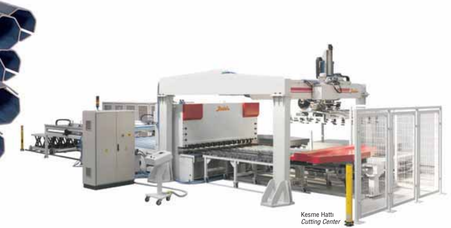
Kesme Hattı Cutting Center