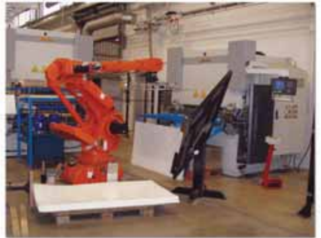
Robot Uygulamalı Abkant Pres Press Brakes With Robot Applications