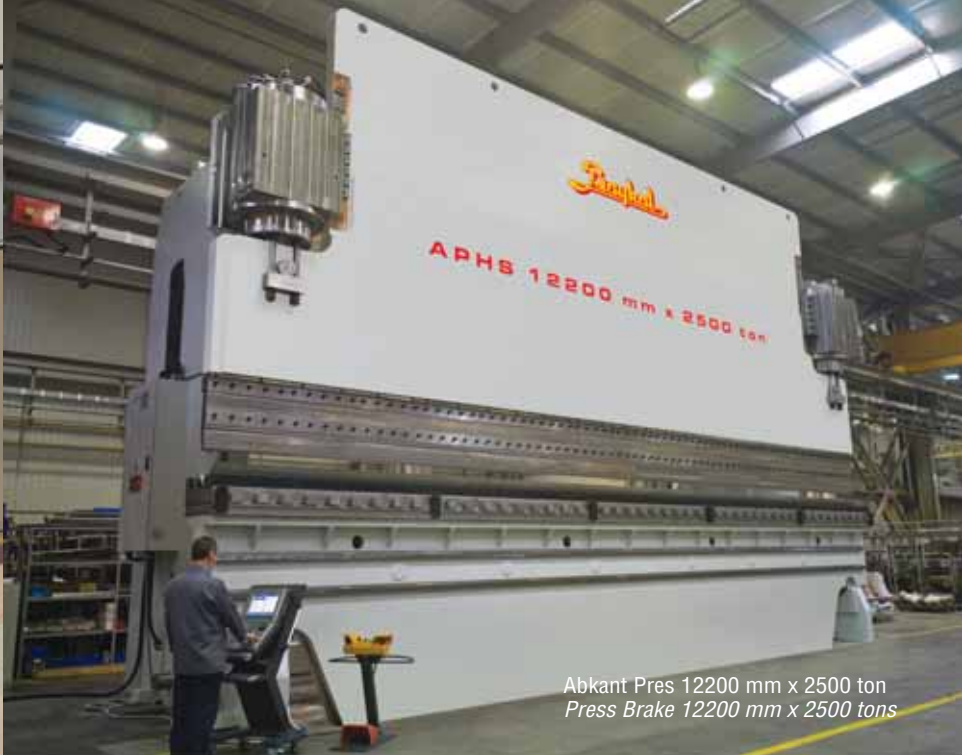
Abkant Pres 12200 mm x 2500 ton Press Brake 12200 mm x 2500 tons