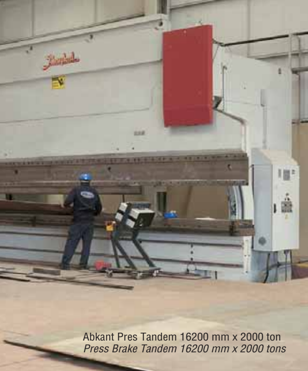
Abkant Pres Tandem 16200 mm x 2000 ton Press Brake Tandem 16200 mm x 2000 tons