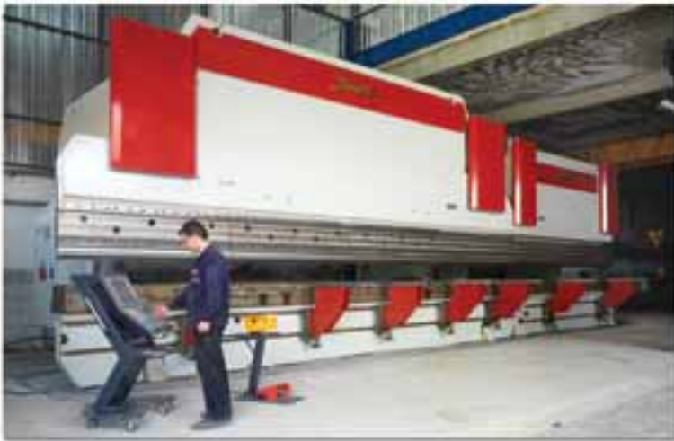
Abkant Pres Tandem Asimetrik 8100 / 4100 mm x 800 / 440 ton Press Brake Tandem Asymmetric 8100 / 4100 mm x 800 / 440 tons