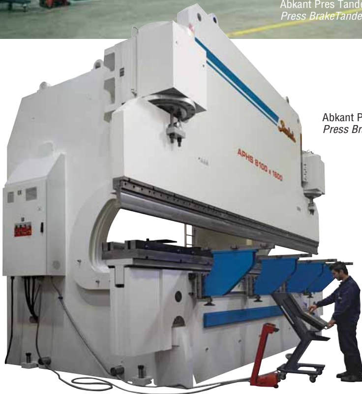
Abkant Pres 8100 mm x 1600 ton Press Brake 8100 mm x 1600 tons