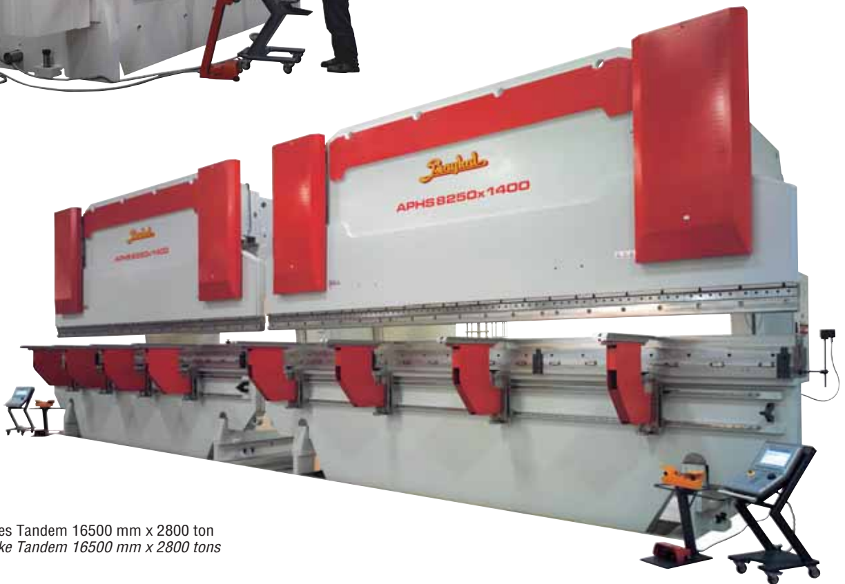
Abkant Pres Tandem 16500 mm x 2800 ton Press Brake Tandem 16500 mm x 2800 tons