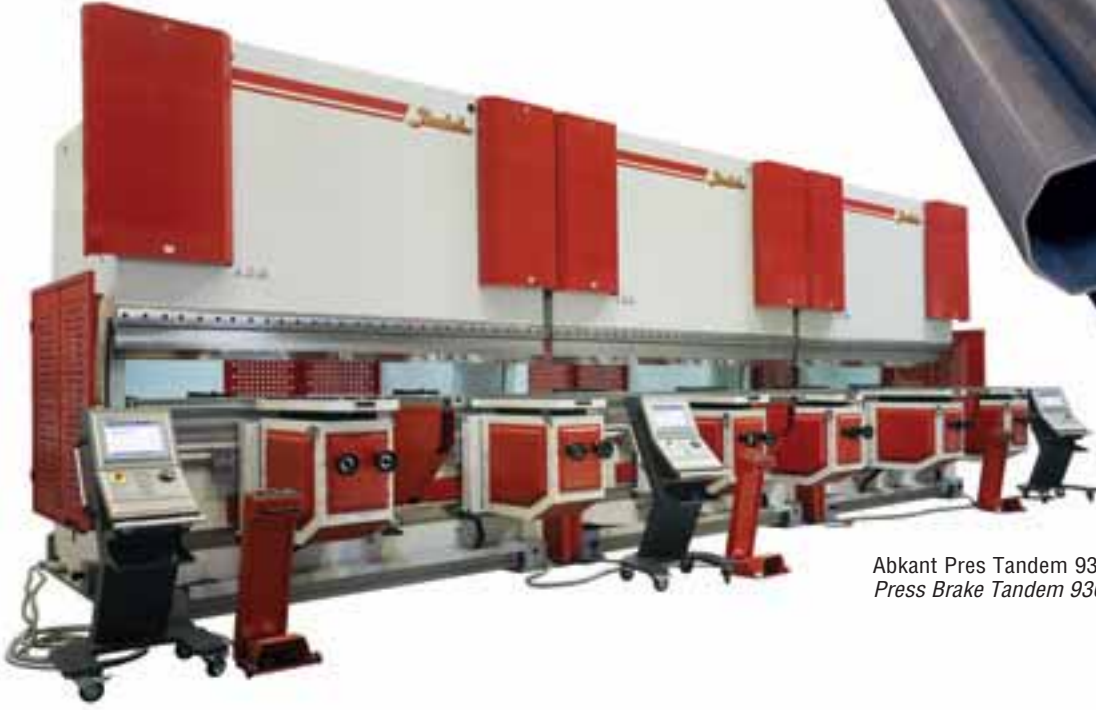
Abkant Pres Tandem 9300 mm x 1320 ton Press Brake Tandem 9300 mm x 1320 tons