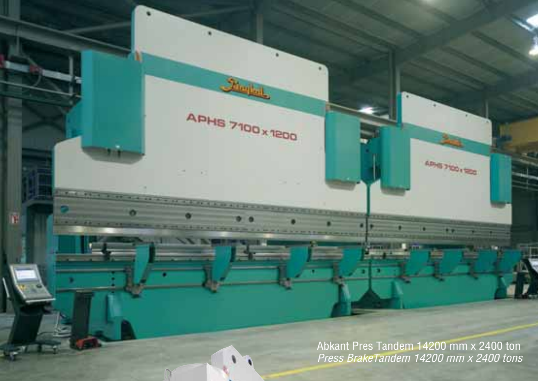
Abkant Pres Tandem 14200 mm x 2400 ton Press Brake Tandem 14200 mm x 2400 tons